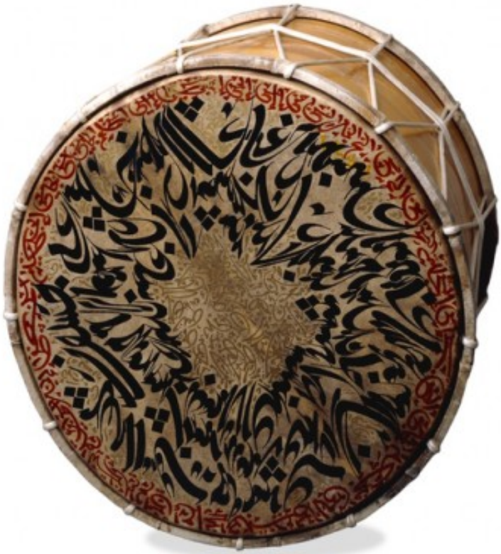
The Drum's Silence, 1997.