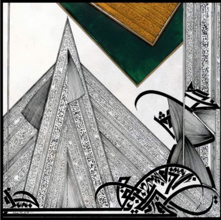
Ghubar Square I, 2009.