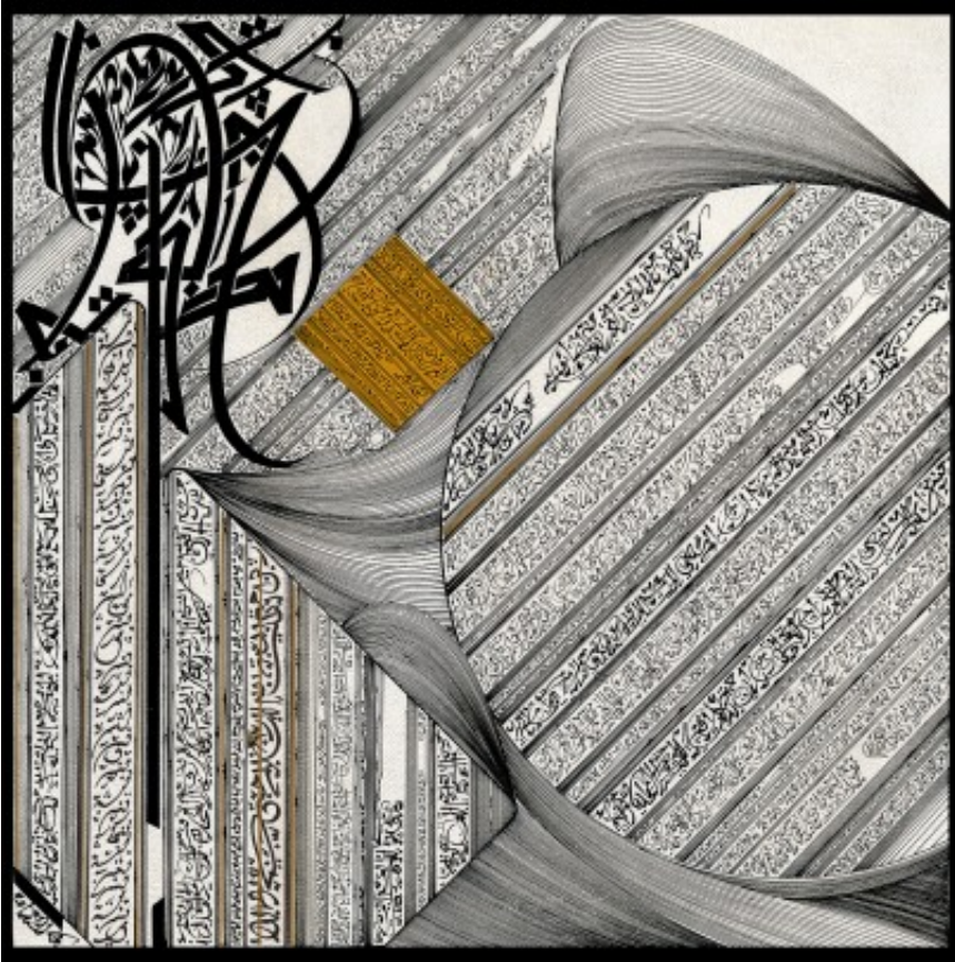
Ghubar Square II, 2009.

His work inspired by Arabic calligraphy is remarkably innovative as the aesthetic dimension of letters brings forth a sense of the poetic – highly rhythmic – arresting us with its rich abstracts compositions. Famous for his meticulous work in ink on parchment, Mahdaoui stresses the visual impact of his compositions, devoided of actual textual meaning, which he refers to as ‘calligrams’ or ‘graphemes’.