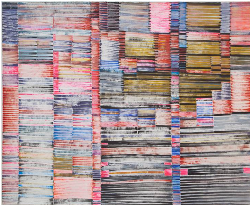
Huguette Caland - Untitled, 1999

In Silent Letters series of works that will be on view at Nathalie Karg Gallery, Huguette Caland has entangled letters (received from and written to friends and lovers while living in Paris) with bold brushstrokes of colors. The cut and torn fragments are rearranged in straight lines and covered with layers of paint. Unlike the previous abstract pieces, her recent work is more quilt-like with numerous lines, dots and patches spanning across the surfaces and largely devoid of human forms. The artworks evoke the sense of intimacy and nostalgia often present in written correspondence.